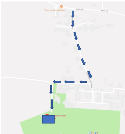
Route to the car park from the main entrance gates